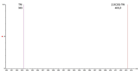
MS spectrum of T2 Triol and standard LIB'UP® U-[13C20]-T2 Triol