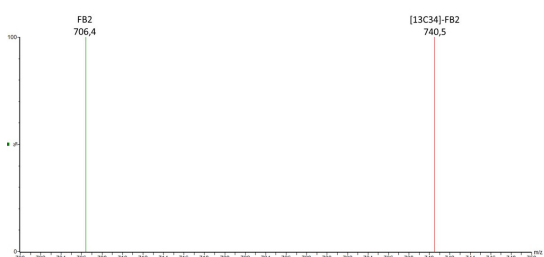
MS spectrum of Fumonisin B2 and standard LIB'UP® U-[13C34]-Fumonisin B2