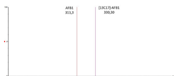
Spectre MS de l'Aflatoxin B1 et étalon LIB'UP® U-[13C17]-Aflatoxin B1